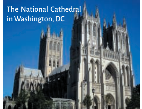
The National Cathedral in Washington, DC