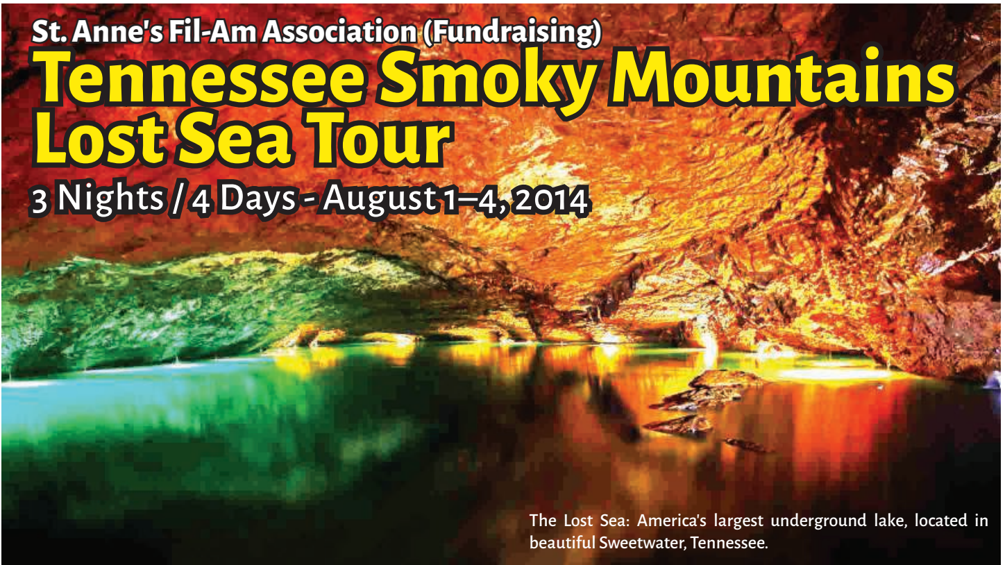
The Lost Sea: America's largest underground lake, located in beautiful Sweetwater, Tennessee.