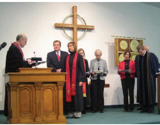
A presbyterian service at First Presbyterian Church in Texas

While ritual/liturgical practice is the central focus of daily and weekly worship in the Roman