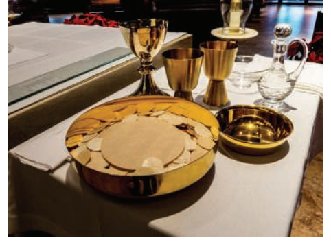
Chalice and Paten are prepared on the credence table before Mass begins.

Any priest, in accordance with the approved custom of the Church, may accept an offering to apply a certain Mass for a specific intention. The priest is not to accept more intentions than what can be satisfied in one year. The offering for a Mass intention is normally $10. Separate Masses must be applied for the intention for each of which an offering and has been made and accepted. However, by way of exception, a priest may celebrate several intentions at one time.