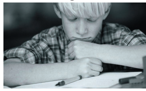
The Archdiocese Responds to all Allegations Quickly and Appropriately