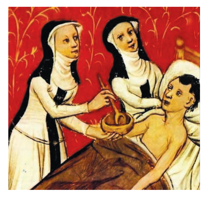
Toward the end of the ninth century, religious orders were founded with the intent of ministering to the sick by building and staffing hospitals.

From Jesus's healing ministry and the belief that all are made in God's image and likeness grew Christians' inspiration to offer care to believers and nonbelievers alike (see Romans 12:13, Hebrews 13:2, 1 Peter 4:9, and 3 John). In the first and second centuries, bishops and presbyters, but mostly deacons, visited and cared for the poor and the sick in their homes. The resources to cover these expenses came from donations by the community. Thus, there was joined the need to care for the ill using the resources of the community. Through the ages, the Church took the lead in establishing hospitals, orphanages, and places