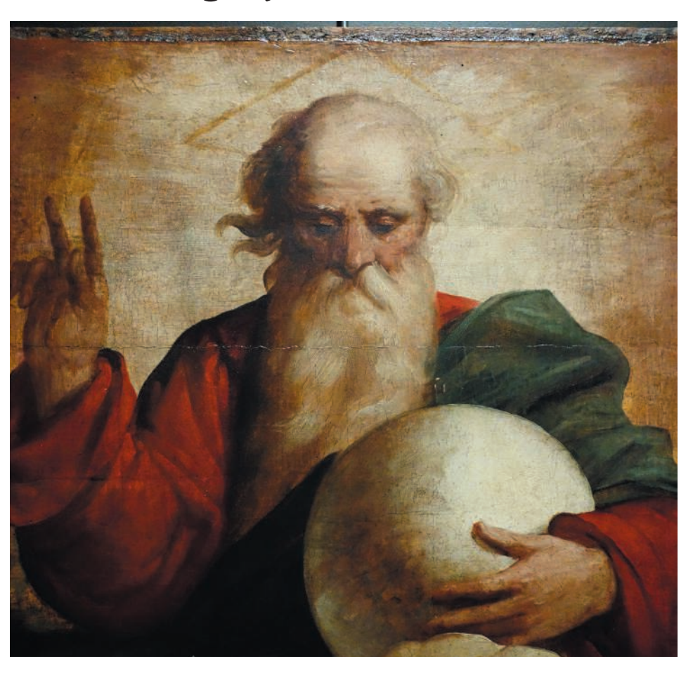
Benediction of God the Father by Luca Cambiaso, circa 1565, oil on wood — Museo Diocesano (Genoa)

According to the principle of analogy, when we call God Father, we must to realize the limits of our language. We are not saying that God is male. God the Father is a spiritual being and has no gender. This does not, therefore, justify a patriarchal system that places women in a subordinate role. On the other hand, we should understand that qualities we apply to human fathers do apply to God in some ways: God chooses to love all of humanity, human fathers love their children. At the same time. God the Father is the father of Jesus Christ (God the Son). Jesus called God Father and taught his disciples to do so as well. His sacrifice on the cross revealed God's love for humanity and fully enabled us to refer to God as our Father. Finally, God watches over and protects us, similar to how a human father watches over and protects his children. Ultimately, God embodies these qualities of fatherhood in an infinitely greater