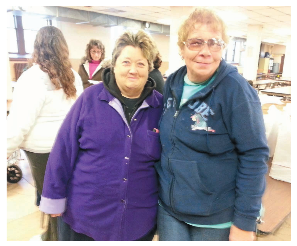
Our traditional Thanksgiving basket giveaway took place last Saturday. It is a distribution of Thanksgiving Baskets to those in need on the weekend before Thanksgiving Day. Volunteers that have assisted, especially those that have distributed the baskets to the recipients, have departed the event with a sense of fulfillment, joyful smiles, uplifted spirits, and tears of satisfaction of making "a difference" in someone else's life. Thank you to all those involved in the preparation, the promotion and the distribution of this Work of Mercy!