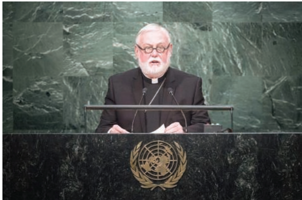
Archbishop Paul Gallagher at the United Nations (Sept 29, 2015)

While these goals are crucial for the future of our world, the success of the MDGs has been limited. While some nations have improved on, or accomplished their specific targets, many nations have been unable to meet any of the goals. As a result, the United Nations began discussing why some places were unable to meet the goals, and reassessed the way in which the goals would be addressed. These reassessments resulted in new, post-2015 Sustainable Development Goals , which were adopted by the UN