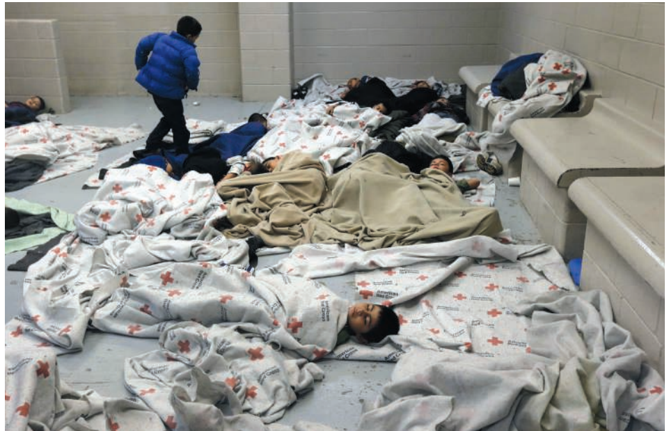
Child detainees sleep in a holding cell at a US Customs and Border Protection processing facility in Brownsville, Texas, June 2014.

In addition to being concerned about the idea of family detention generally, the Bishops have spoken explicitly about the need to protect vulnerable refugees and asylum seekers such as the women and children currently in immigrant detention facilities. Strangers No Longer: Together on The Journey of Hope , states: those who flee wars and persecution should be protected by the global community. This requires, at a minimum, that migrants have a right to claim refugee status without incarceration and to have their claims fully considered by a competent authority.