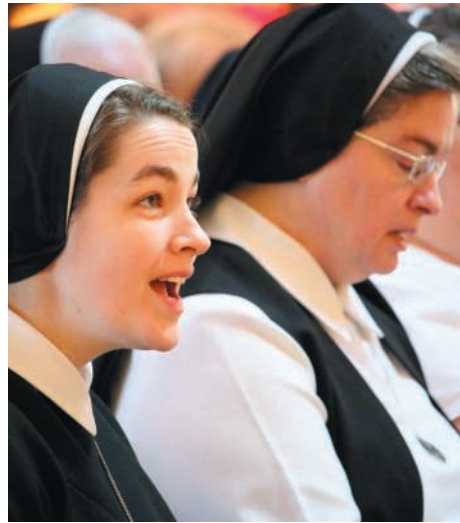
and obedience. For more information, please see the Year of Consecrated Life Website at: http://newark-yearforconsecratedlife.weebly.com/

Since 1997, the universal Church has celebrated the World Day for Consecrated Life. On Tuesday, February 2 nd in the Cathedral Basilica at 7:30 pm on the Feast of the Presentation of the Lord the Archdiocese will observe this day with a special emphasis on the call to consecrated life in today's world. This Feast is also known as Candlemas Day; the day on which candles are blessed symbolizing Christ who is the light of the world. So too, those in consecrated life are called to reflect the light of Jesus Christ to all peoples. Come join us in joyful prayer! The consecrated life is one way that men and women live out their baptismal commitment as followers of Jesus. Some become members of a religious congregation or a secular institute. Others remain single and make a profession to God through the local bishop and are known as consecrated virgins. We recognize and give thanks for those who have consecrated their lives to God and the Church through the vows of poverty, chastity,