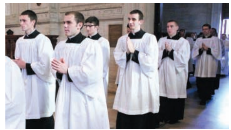
Next Sunday, April 17, is World Day of Prayer for Vocations. What's yours? Come and find out!

There are no perfect priests, nuns, or Popes. Everyone is in need of God's mercy. Despite your sins and weaknesses, God still calls YOU to a special vocation within the Church.