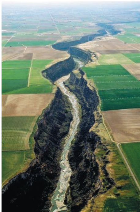
The Snake River near Twin Falls, Idaho, cutting through the plain. Divisions like those Jesus announced can run deep.

The coming judgment forces us to look at the implications of our commitments. As Jesus warned in last Sunday's Gospel, a commitment of faith requires us to change our attitude toward material possessions and to take even more seriously our moral responsibilities. Here he reminds the crowd that those who commit to him will find it affects the way they relate to friends and family members. The angel who an-