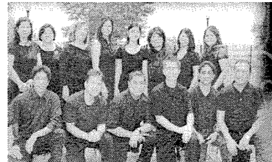
Ocean of Mercy Choir