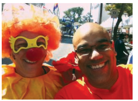
The Saint Anne's Festival in 2012.

Festival Committee Members have begun meeting, making plans for this year's Festival — happening July 25,26,27, 2014!