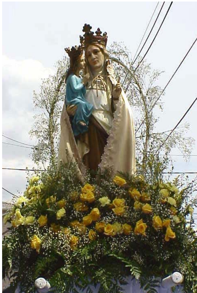
Procession of Saint Anne (following 12 Noon Mass)